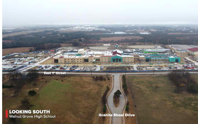
LOOKING SOUTH Walnut Grove High School