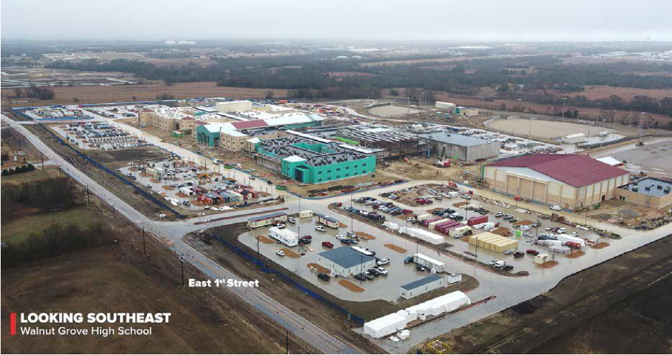
LOOKING SOUTHEAST Walnut Grove High School